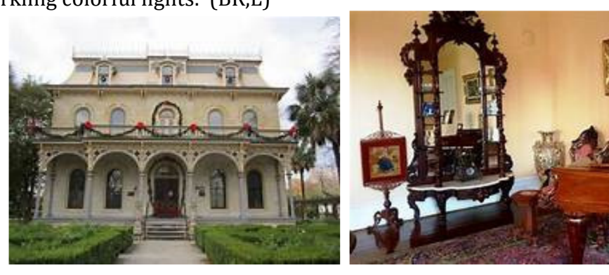
DAY 4 Monday STEVE'S HOUSE - DEPART FOR HOME This morning have some breakfast before checking out of the hotel. Drive to the famous King William District which was started by the German well-to-do merchants at the turn of the century. Here, we will visit "Steve's House", a Victorian home beautifully decorated for the holidays. Then before you know it, it's time to transfer to the airport. Depart with warm memories of the gracious hospitality Texas is so famous for. Thank you for exploring with us and join us soon for another wonderful adventure! (B)

This morning begins with a hearty Brunch at the historic Menger Hotel. After brunch this morning, we depart for a full day of sightseeing. We will visit the beautiful Mission San Jose, "Queen of the Missions". See the Rose Window, one of the finest pieces of Spanish Colonial architecture in the country. Our next stop is San Fernando Cathedral, the oldest cathedral in the United States and the spiritual center of San Antonio. Have a look inside the Spanish Governor's Palace, once the residence of the highest ranking Spanish military official. After a scrumptious late lunch at the legendary Mi Tierra Restaurant.we will continue with our tour guide visiting San Antonio's first mission, the Alamo. Take your seatat the IMAX Theatre for "Alamo .... The Price of Freedom". Relive history's unforgettable thirteen days of glory as 189 Texan and Tejano defenders fight for independence. IMAX puts you in the middle of the action with its six story screen and six-track stereo sound. Afterwards, walk around the chapel which is all that remains of the original Fort. The remainder of the day you may want to enjoy strolling along the river walk or return for some shopping time at the oldest and largest Mexican Market in the U.S. Dinner will be on your own tonight. Tonight we will hop on the San Antonio river barge for a relaxing ride amidst all the sparkling colorful lights. (BR,L)